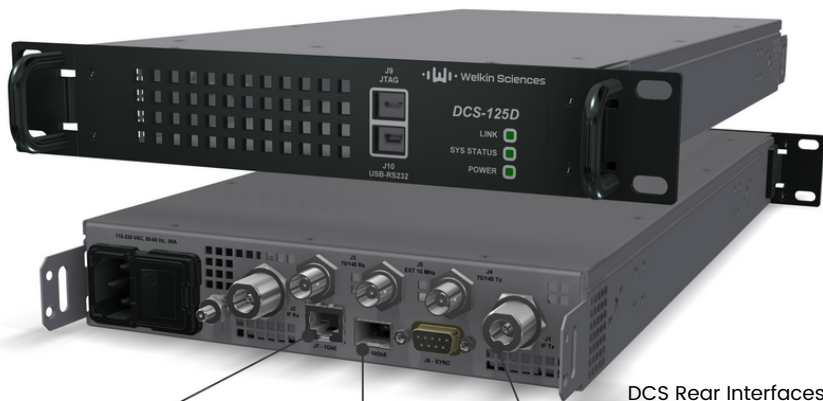
DCS Rear Interfaces

1 GbE RJ45 network connector for SNMP status and control