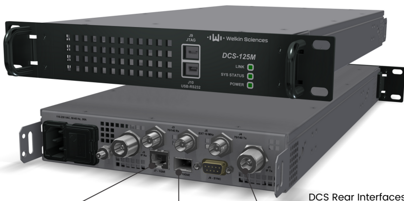
DCS Rear Interfaces

1 GbE RJ45 network connector for SNMP status and control